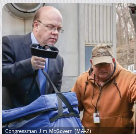
Congressman Jim McGovern (MA-2)

A full-court advocacy press helped urge Congress to restore nearly $50 million in Older Americans Act appropriations that were lost during sequestration.